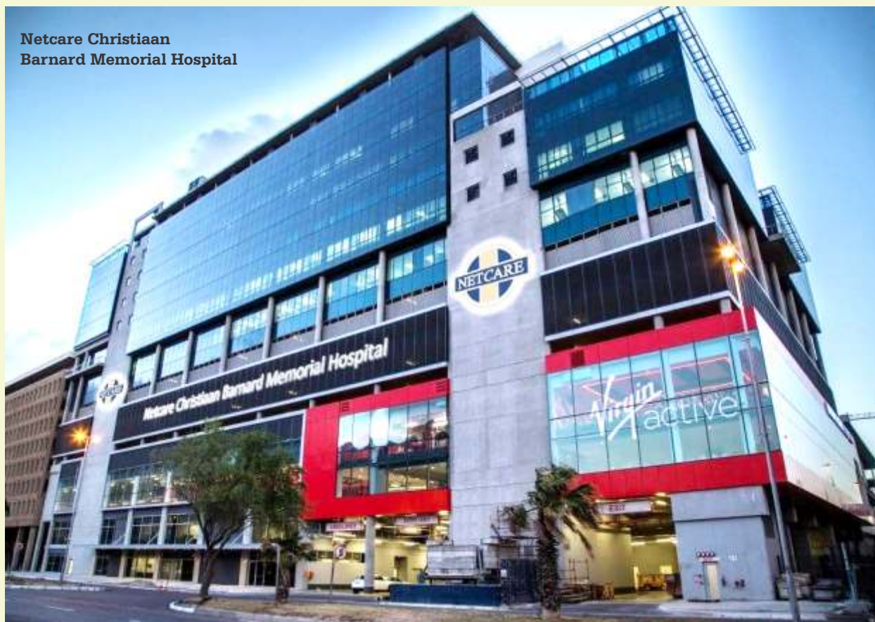
Netcare Christiaan Barnard Memorial Hospital

A frica is the world's second largest and second most-populous continent behind Asia in both categories. At about 30.3 million sq km (11.7 million sq miles) including adjacent islands, this continent covers around 6 per cent of the earth's total surface area and 20 per cent of its land area. With 1.2 billion people as of 2016, it accounts for about 16 per cent of the world's human population.