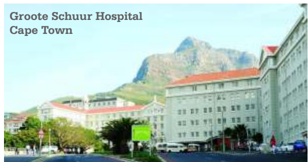
Groote Schuur Hospital Cape Town

Between 2005 and 2012, Africa added 70,000 new hospital beds, 16,000 doctors, and 60,000 nurses. Healthcare provision is becoming more efficient through initiatives such as Mozambique's switch to specialist nurse anesthetists and South Africa's use of nurses to initiate antiretroviral drug therapy. The introduction of innovative delivery models is increasing capacity still further.