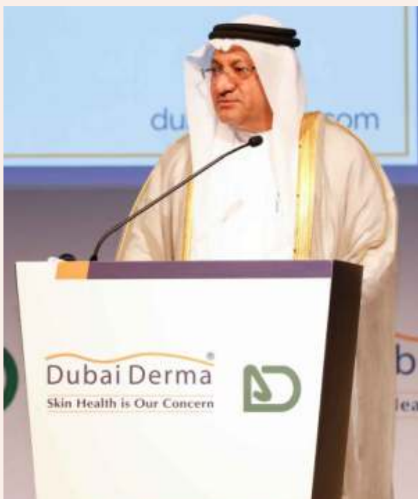
H.H. Sheikh Hasher bin Maktoum Al Maktoum inaugurates Dubai Derma 2018

For the first time in the UAE, Emirates Derma Conference and Exhibition, is featuring the all new 'Emirates Injection Boot Camp' on the first and second day of the conference, which is a dedicated gathering for injectors and specialists who will specially focus on 'soft tissue augmentation' and its impact on patients. During this exclusive camp, a number of dedicated sessions on pure injections, workshops and live demonstrations of complicated skin treatments will be explored in greater depth.